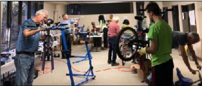
Cleaners, preppers, and mechanics hard at work.