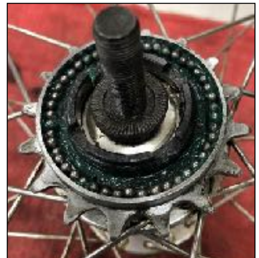
Cleaned, greased, and ready to go back together.