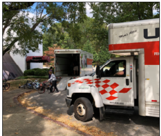
Volunteers unload the trucks and bring the bikes in to the refurbishing center –the Columbia Flier building.