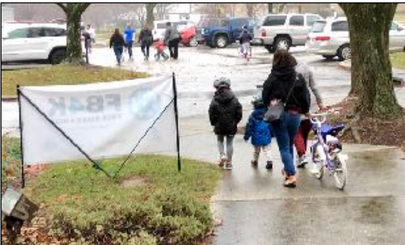
A new bike; a new world of possibilities