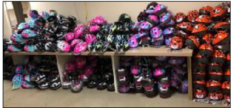
Helmets await their new owners