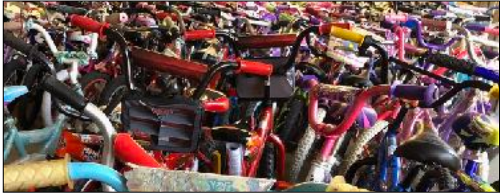
Bikes awaiting refurbishment.

In ten weeks, volunteers cleaned, adjusted, and repaired all but 4% of the bikes. Most bikes merely needed cleaning and adjusting. Repair parts, when needed, were taken from unrepairable bikes, or purchased from our sponsor, Quality Bicycle Products, at a significant discount. Each and every bicycle was checked for safety by bicycle mechanics whose time was donated by our sponsor, Race Pace Bicycles. Tools were provided at a significant discount by our sponsor, Park Tools.